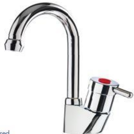
35 \Phi Mounting Hole