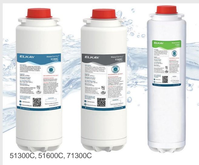
51300C, 51600C, 71300C