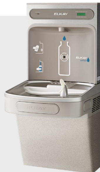
LZWSRK – Retrofit Bottle Filling Station Kit LZS8S – Existing EZ Cooler

Upgrade non-filtered coolers to filtered with the LZWSRK and EWF3000 retrofit products.